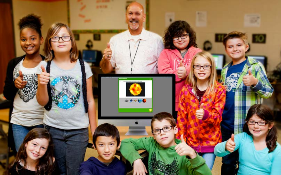
Students and teacher give MobyMax an enthusiastic thumbs up!